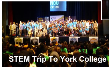
STEM Trip To York College