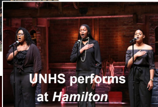
UNHS performs at Hamilton