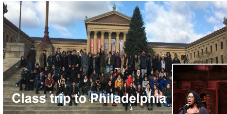
Class trip to Philadelphia